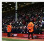
Liverpool back down on prices

Fenway Sports Group (FSG) issued an apology on Wednesday evening and scrapped the controversial top-price £77 general admission ticket for next season that had caused Anfield fans to protest.