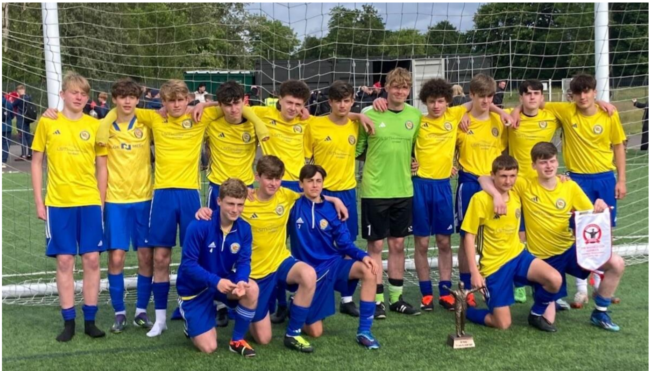
Shankly Cup winners 2024 Dynamo Childwall